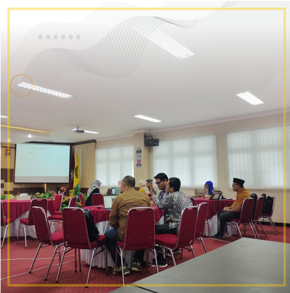
Foto 1: Dokumentasi Kegiatan Penyusunan RPS Berbasis Outcome-Based Education (OBE)